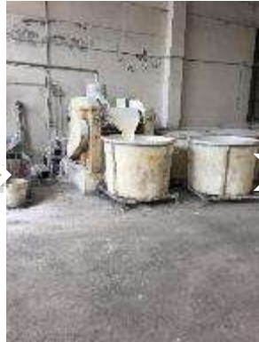
2. Mixing paste