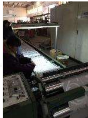
6. Quality Control