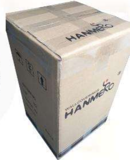
Packing With hanmero logo