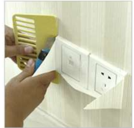
6.Switch boxes handing

Mark an "X" on the position of switch box by knife, use scraper to smooth the round of the switch box. Cut the wallpaper along the edge of it. tear up the rest wallpaper finally.