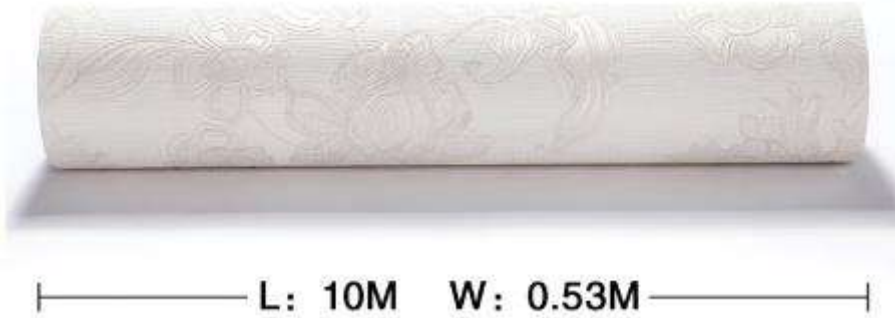
Deep Embossed wallpaper