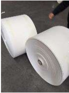
1. Back paper sending