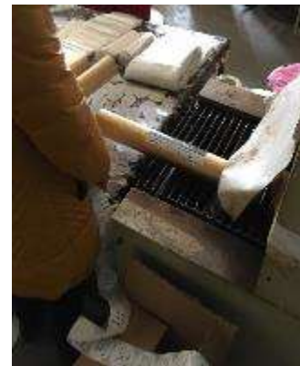
7. Collect rolls and packing